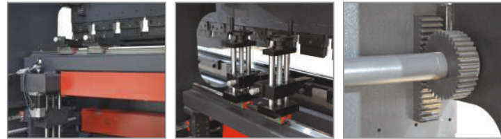
▲ CNC Auto R-axis Optional