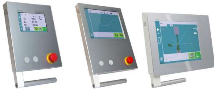
▲ Standard Controller Cybelec 8PS

Options for increase in Axis and CNC system is available on specific request.