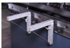
Front Sheet Support