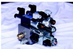
Horebiger Hydy. Servo Block