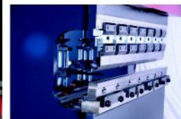
Adapter & Tooling